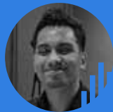
ALDIE NUSA PUTRA PATHWAY ALUMNI

Remember, you can contact SAE Indonesia admissions team at: ☎ (+62) 21 781 7188 📞 0817 1717 6567 ✉ jakarta@sae.edu